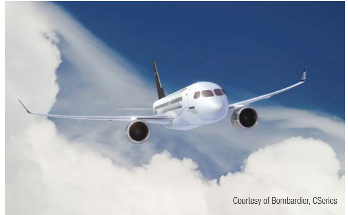
CSeries